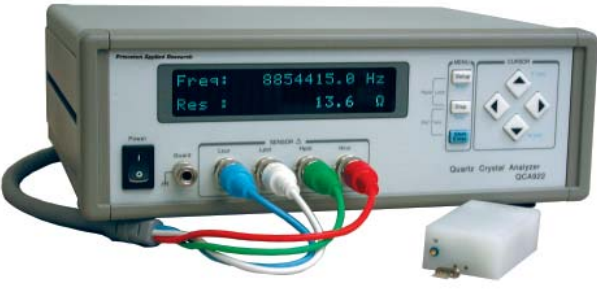
QCM922 Main Body, Cable, and Au Resonator

Princeton Applied Research is proud to offer the QCM922 Quartz Crystal Microbalance. The QCM922, an instrument developed for piezoelectric gravimetry in the ng-µg regions, monitors both the resonant frequency and resonant resistance of a Pt or Au coated AT-cut quartz crystal. The resonant frequency changes with the effective surface mass on the crystal, and the resonant resistance changes with the viscosity of the material interfacing with the surface of the quartz crystal. Capable of covering a wide range of applications, the QCM922 was developed primarily for applications where it is used in conjunction with a potentiostat/galvanostat as an Electrochemical Quartz Crystal Microbalance (EQCM).