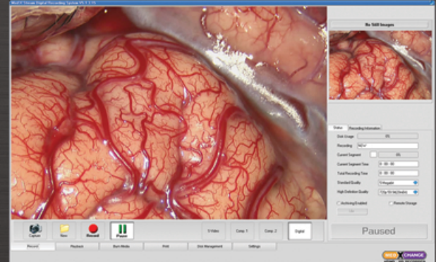
Recording - Capture from 720p HD Video

HDMD™ created Blu-ray data discs are only compatible in computers equipped with Blu-ray drives; they will not play in home movie players