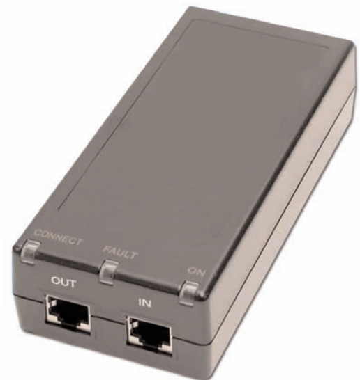
Power over Ethernet (PoE) Single Port Injector

A11-B32 CONNECTIONS-32 Programmer's Toolkit with ActiveX Controls: Write your own special software to control the digiBASE-E from LabView, Visual C++, or Visual Basic. List mode operations are available only using your own custom software.