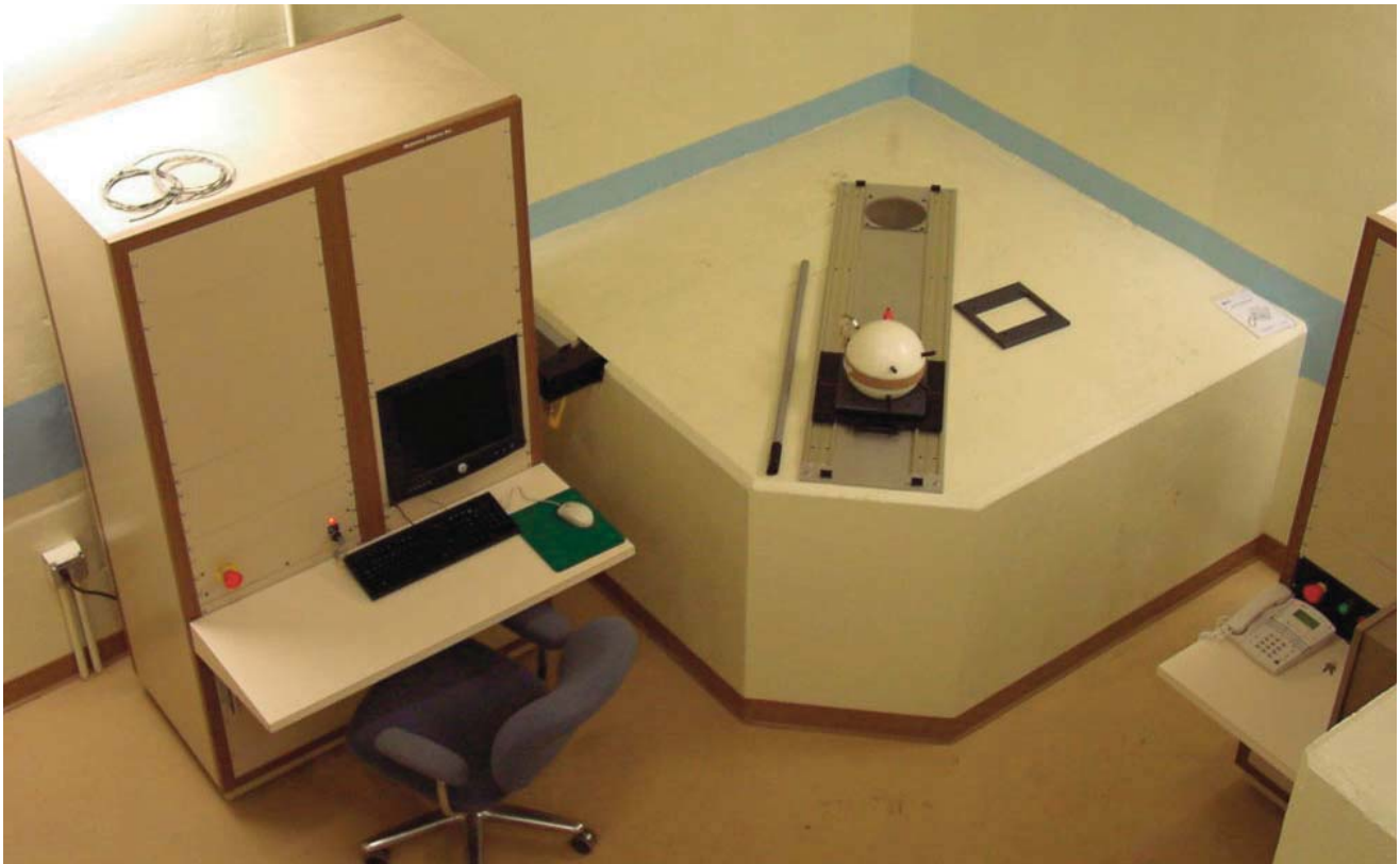
Model WI90 Well Irradiator