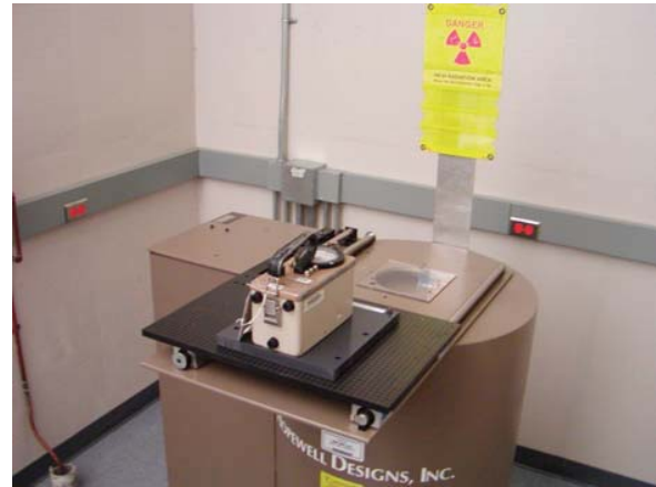
Model WI90 Well Irradiator

The source exposure distance can range from 2 to 40 feet, more if desired. A berm of earth and concrete is constructed to a height of about 4 feet above floor level. This berm provides the horizontal shield for the operator and restricts access to the well hole. The system is designed so that the exposure rate at the operators' station is less than 2 mR/hr.